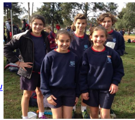
Our Division Cross Country runners