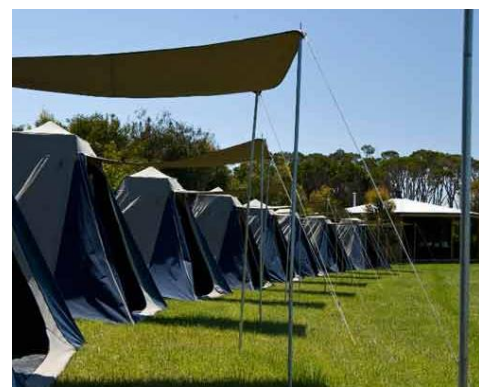
Gr5 tent camp